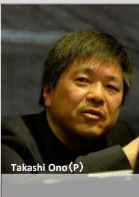
Takashi Ono (P)